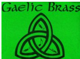
MP3: "An Poc Ar Buile" by Gaelic Brass