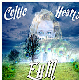
MP3: "Celtic Heart" by Ehm