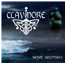
MP3: "Auld Lang Syne" By