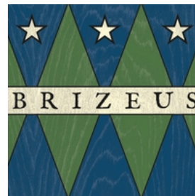
MP3: "Chick Pipers" by